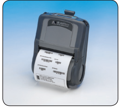
QL 420 Plus™

Bring the flexibility of wireless printing to your 4-inch label or receipt applications with Zebra's QL 420 Plus mobile printer. Built to survive the rigors of warehousing, distribution, and route accounting, the QL 420 Plus offers a mobile mount option to allow printing in a forklift or vehicle.