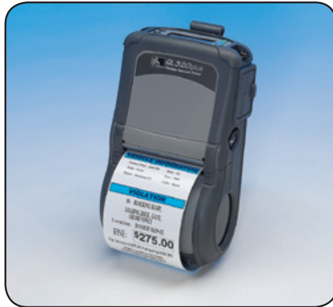
QL 320 Plus™

Zebra's popular QL 320 Plus mobile printer, for print widths up to 3 inches, was the first to offer the flexibility of 802.11b/g radio modules to meet evolving needs and wireless standards. Count on its durable design to endure tough manufacturing or shipping/receiving environments.