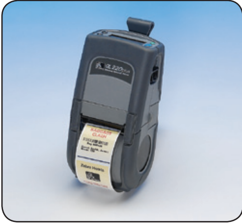
QL 220 Plus™

Take 2-inch label, ticket, and receipt printing where stationary and larger mobile printers dare not go—whether it's down store aisles, on hospital rounds, or onto retail pharmacy counters. Strap or clip on the sleek, 1.04-pound QL 220 Plus network-addressable label/receipt mobile printer and move with ease!